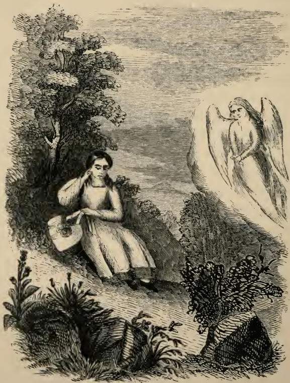
Anna finds no joy while a slave to evil passions.